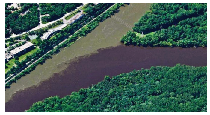
Confluence of the Minnesota (left) and Mississippi (right) rivers - Minnesota Pollution Control Agency File (undated)

If you continue up and to the right, you will stay on the Mississippi River, but if you branch left, you would be on the Minnesota River. You can continue up the Minnesota River all the way to Shakopee, where you can listen to the kids screaming on the roller-coasters at Valley Fair. There are very limited locations to the beach, but the Minnesota River is always a great day excursion.