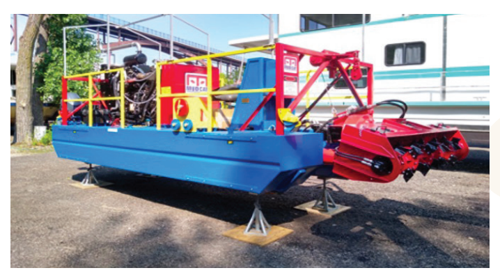
SPYC dredger (July 2021)

Last year we embarked on taking control of our own dredging destiny in the Upper Harbor by purchasing and deploying a dredger and storage infrastructure for bottom sediment.