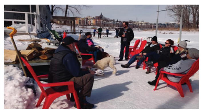
Boot hockey and potluck (February 2022)

Our first social event of the 2022 season was the Boot Hockey and Potluck held at the SPYC clubhouse and on the ice in the harbor. We had a great turnout and fantastic weather, and some seriously (well not so much) competitive boot hockey.