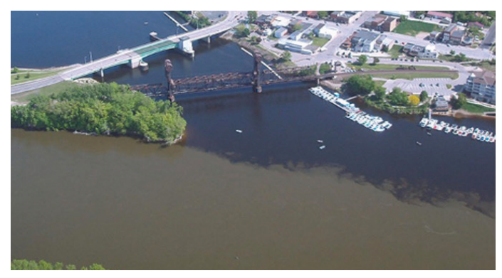
Confluence of the Mississippi (left) and St. Croix (upper) rivers, Prescott, WI

Prescott, Hastings, Red Wing on the Mississippi River, and Stillwater on the St. Croix all make great weekend trips, each with their own character to explore.