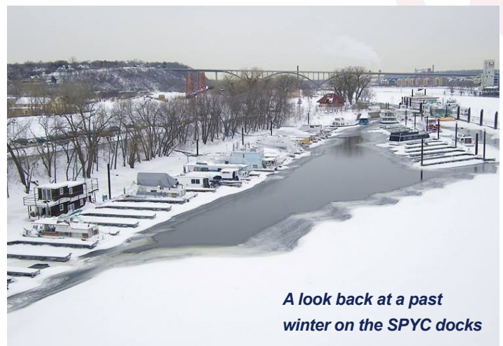
A look back at a past winter on the SPYC docks