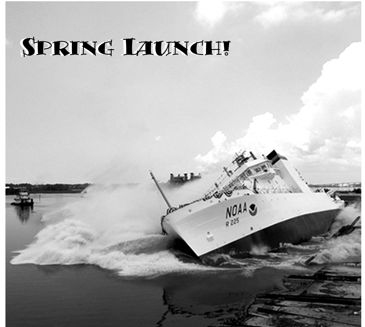
100 Yacht Club Rd. B-1, St. Paul, MN 55107